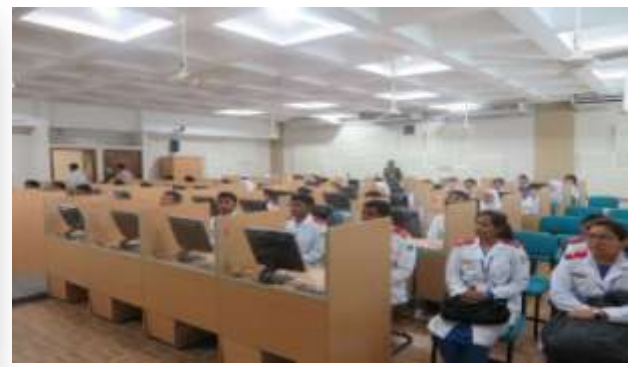
English Language Lab

13. Lab & Museum. All Colleges have required number of practical labs named Physiology Lab, Bio-chemistry Lab, Histology Lab, Dissection Hall and Museum, Forensic and Community Medicine Lab for practical classes.